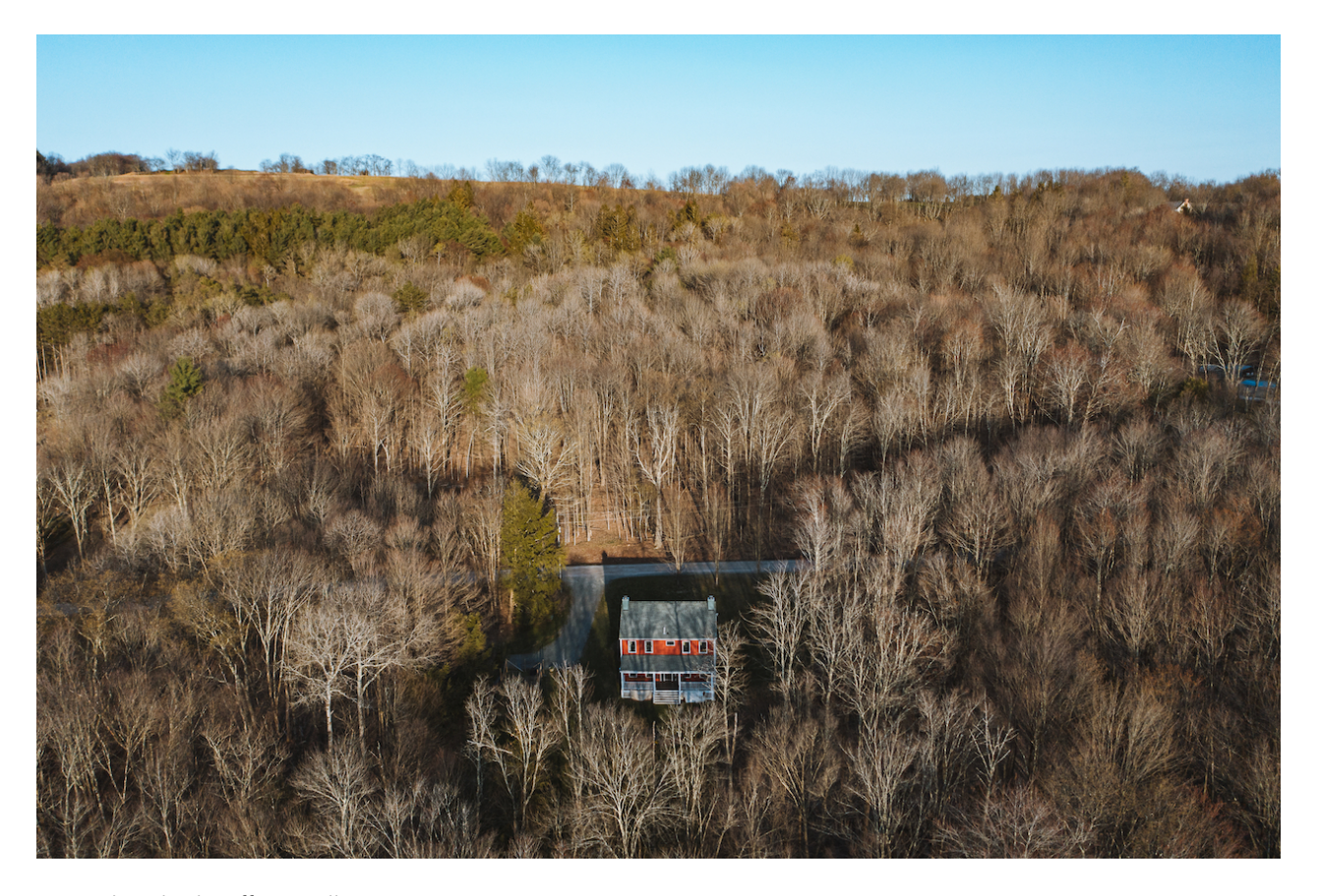
181 Boband Rd, Jeffersonville, NY 12748 $495,000