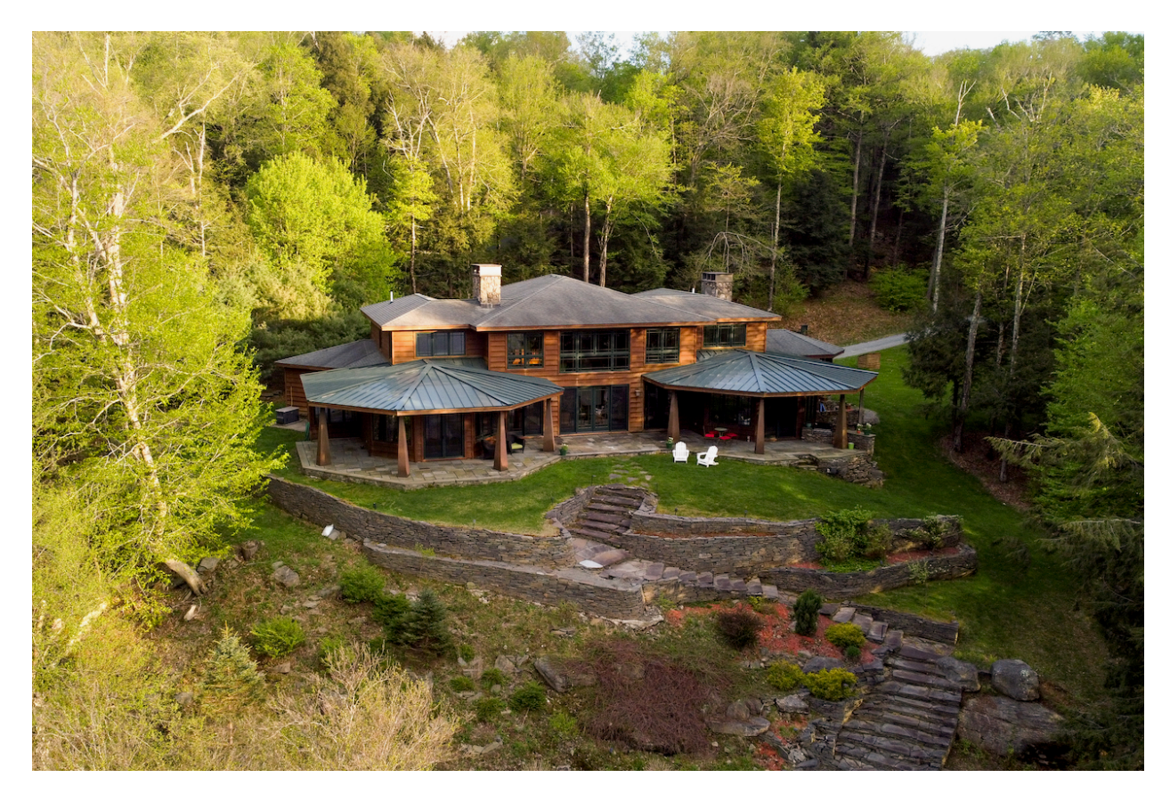
4 Crowley Road, Roscoe, NY 12736 $2,985,000