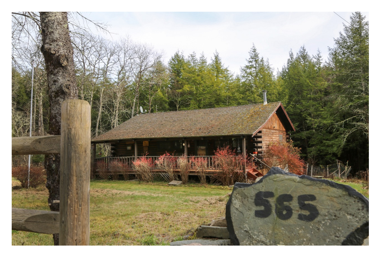
565 & 561 Willowemoc Rd., Livingston Manor, NY 12758 $249,900

Having been lovingly maintained and lived in year-round for over 20 years, the home has stood vacant for the past five years, so there are some unknowns. Though this wonderfully wild property needs some love and updates to bring it back to its former glory, its potential isn't hard to see.