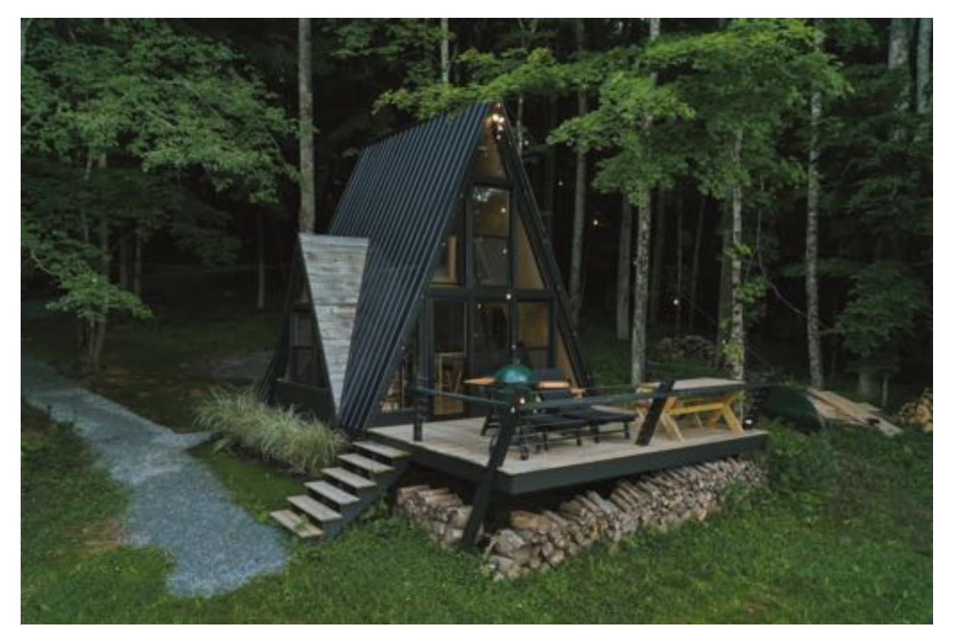
42 Lake Jeff Drive, Jeffersonville, NY 12748 $249,000