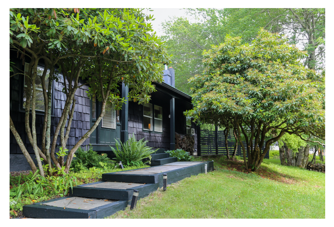
4 Bussey Lane, Livingston Manor, NY 12758 $515,000