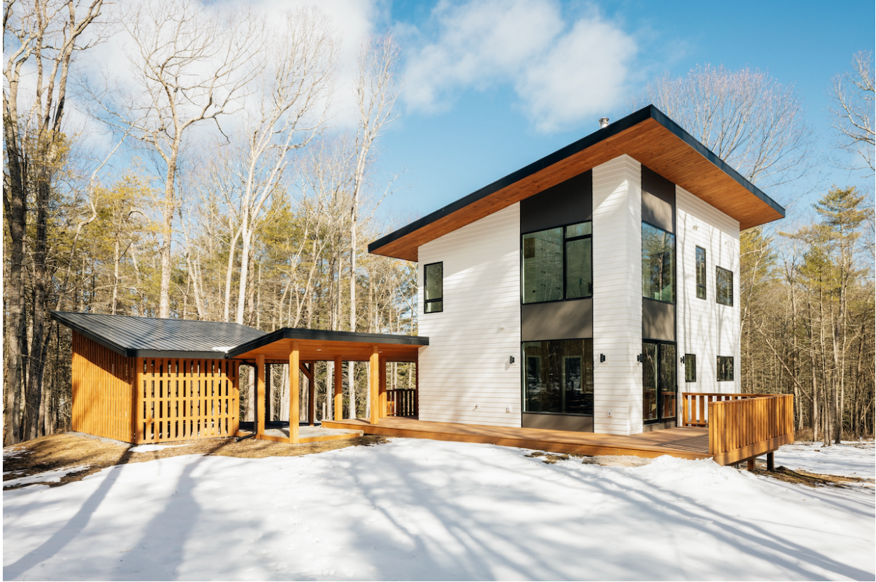
20 Carpathy Court, Glen Spey, NY 12737 $695,000